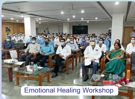
Emotional Healing Workshop