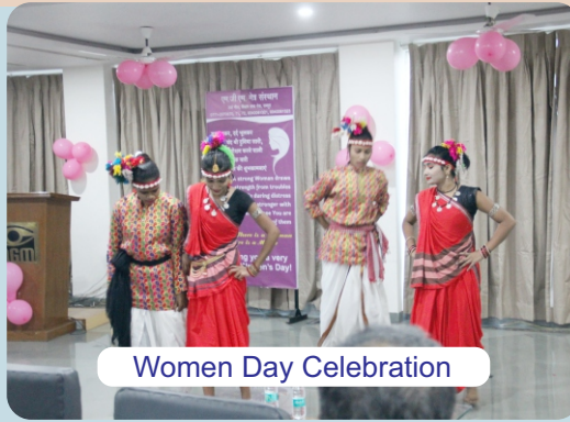
Women Day Celebration